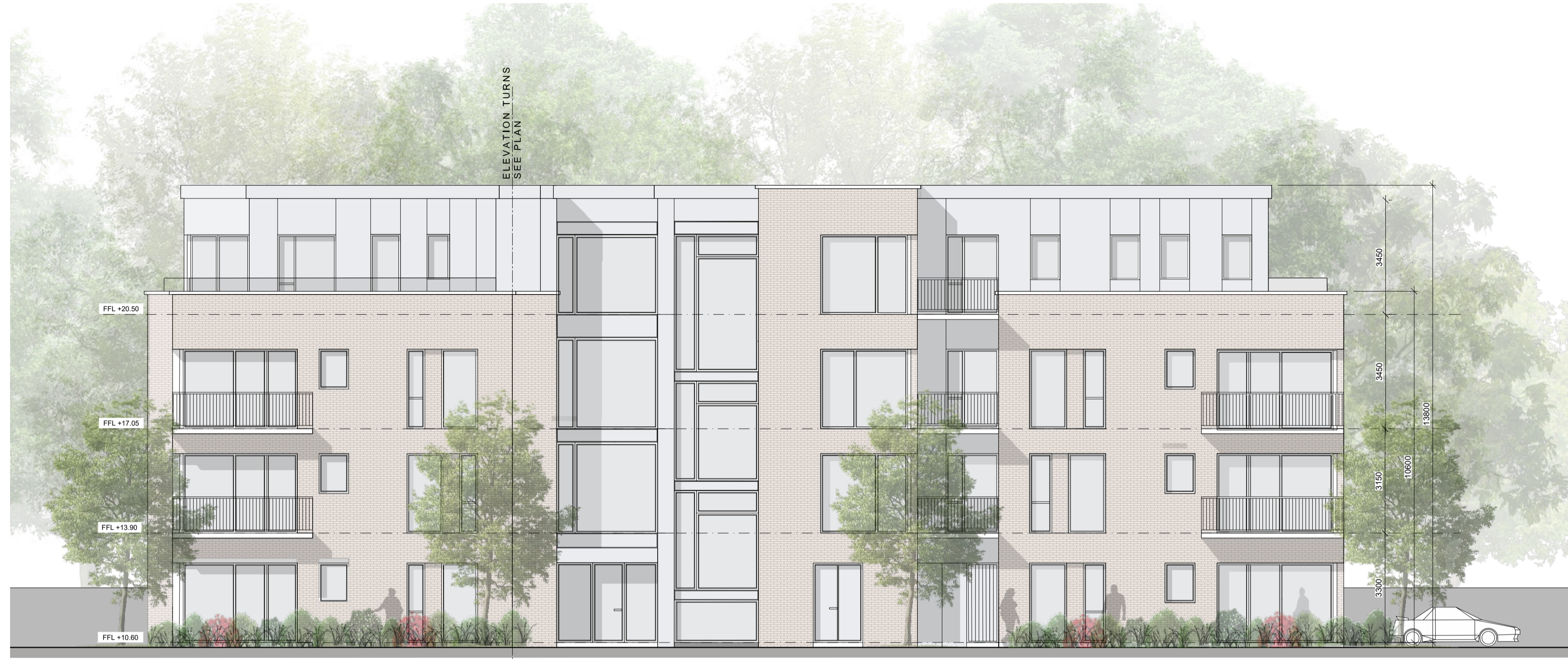
BLOCK 6 WEST FACING ELEVATION SCALE: 1:100 MATURE PLANTING BEYOND SHOWN INDICATIVELY.