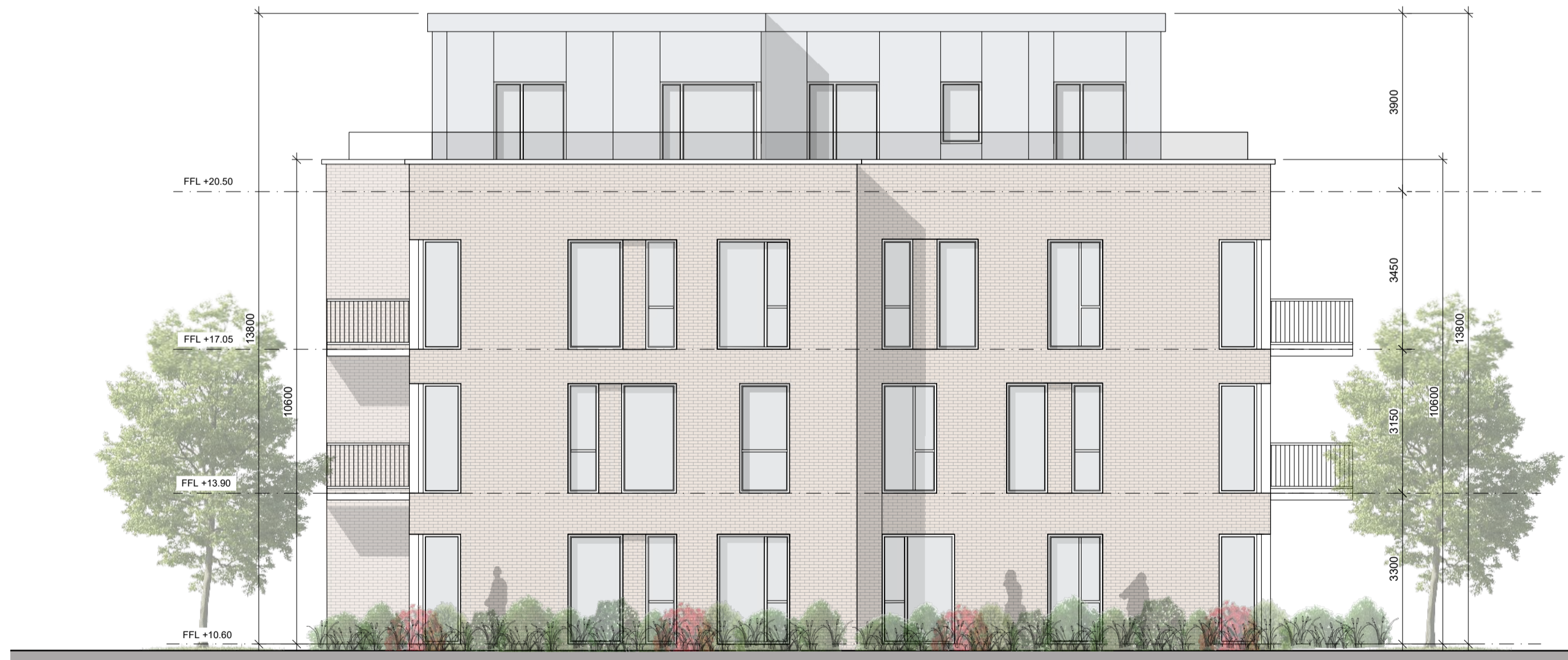
BLOCK 6 NORTH FACING END ELEVATION SCALE: 1:100