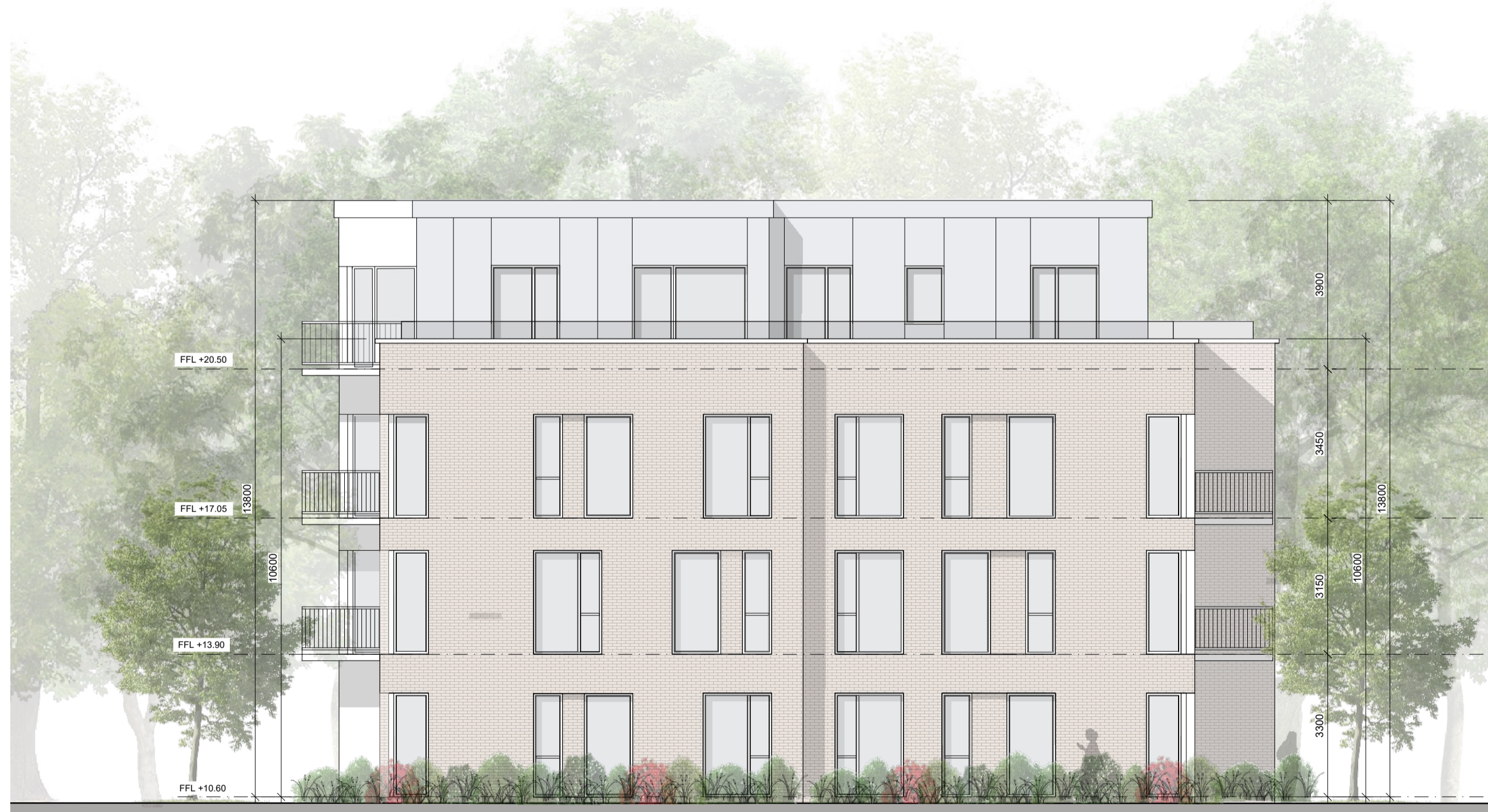
BLOCK 6 SOUTH FACING END ELEVATION SCALE: 1:100 MATURE PLANTING BEYOND SHOWN INDICATIVELY.